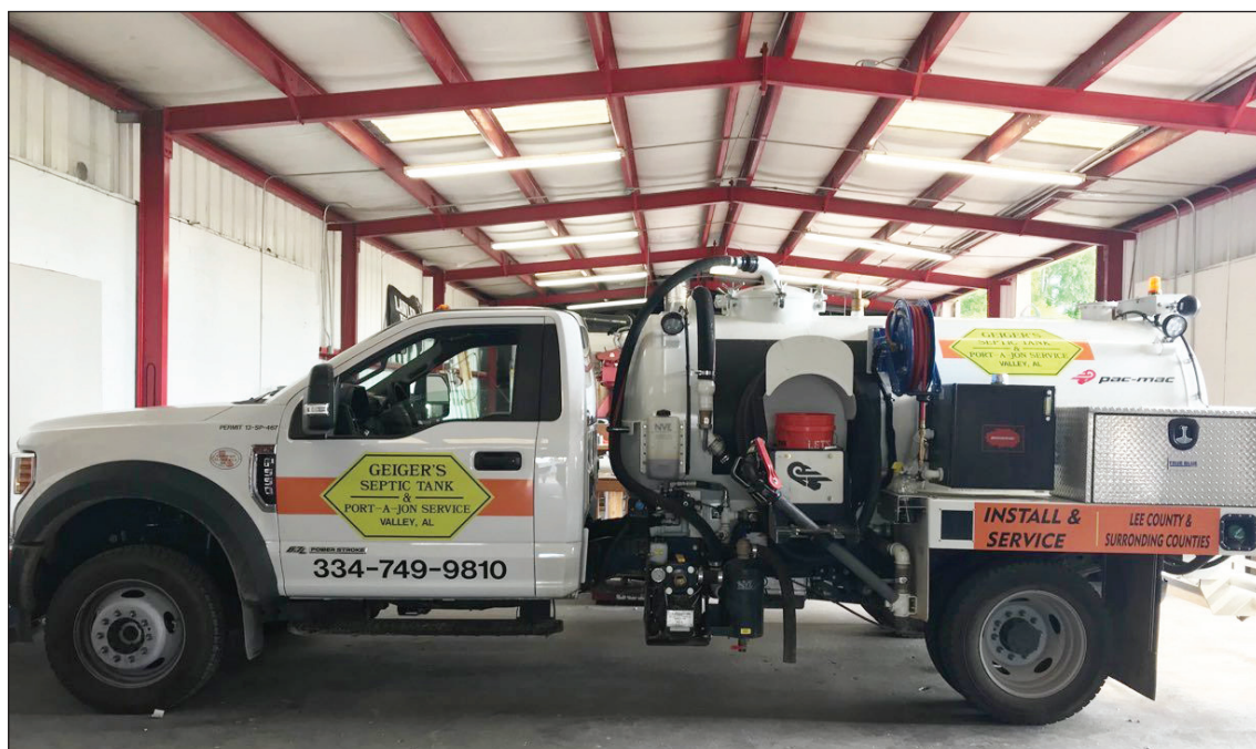
Pictured is one of the Geiger's Septic Tank & Port-A-Jon Service trucks used in the field.