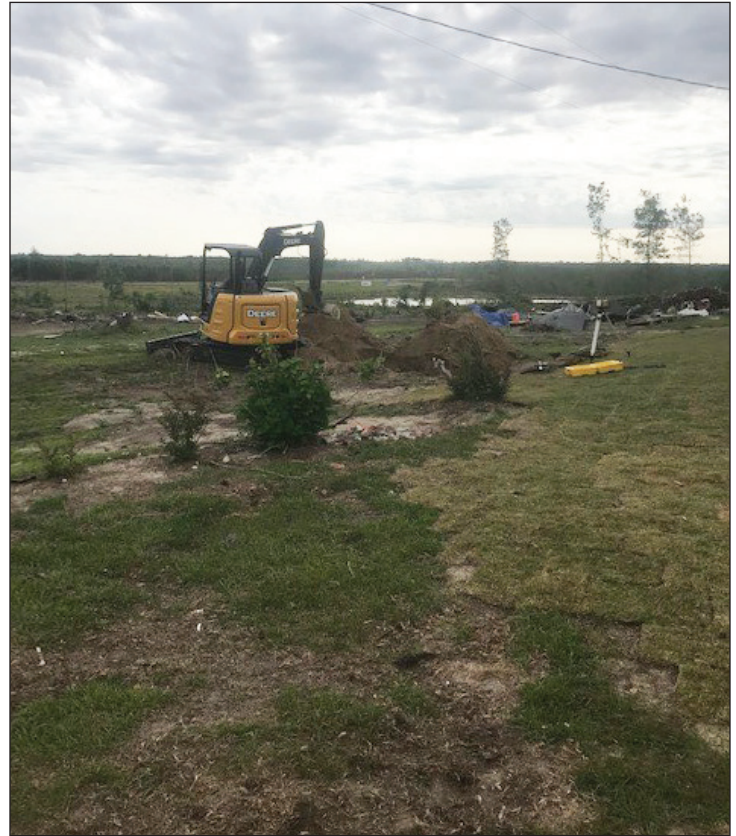
Photos of work in progress.