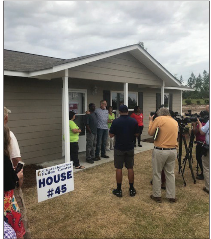
The dedication of each of the two houses was well attended.