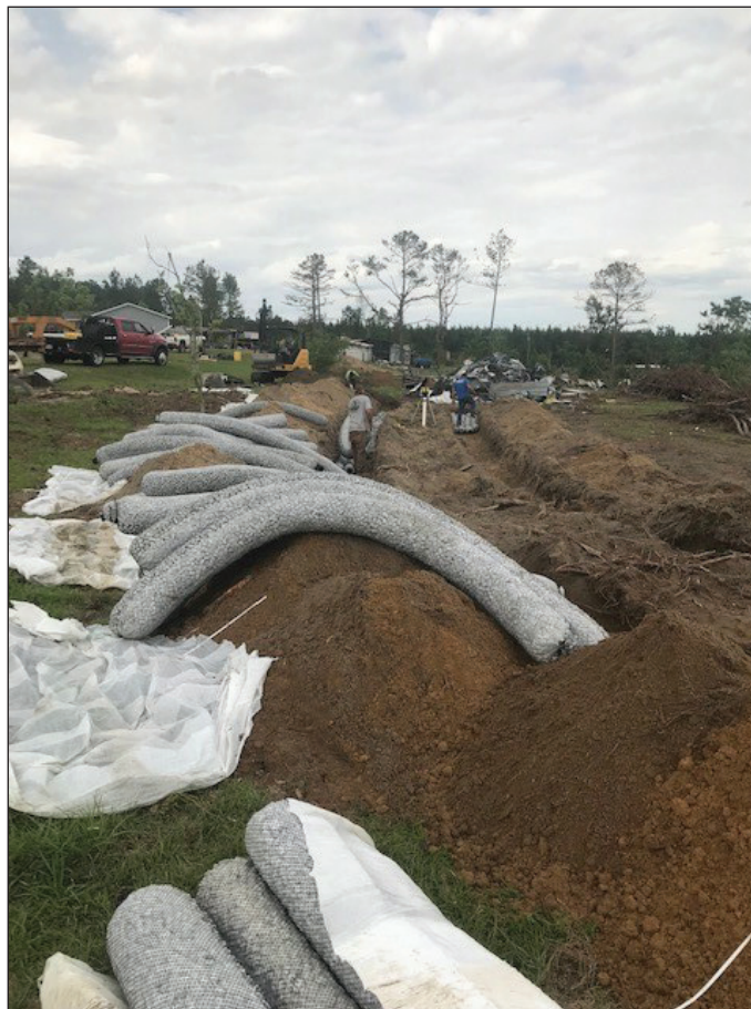
Installation of a new septic system for one of the Disaster Relief families in Lee County.