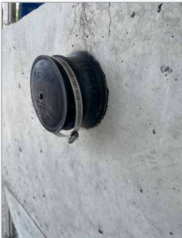
During installation, boot is popped out.

It may also be worth noting that the ADPH requirement for manufacturers to maintain a log of tanks sold (as part of the ADPH inspection process) was removed from the rules.