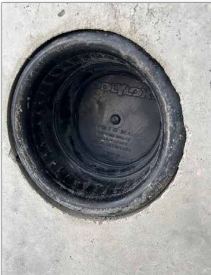
Boot as manufactured and poured flush with the tank.

This applies only to tanks manufactured after February 13, 2023.