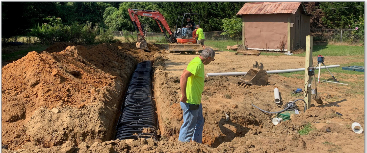
Installation scenes from a recent project.